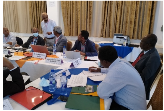
Group work- SP evaluation & preparation

ENTRO hired individual consultant, who has demonstrable experience in the Nile basin, to undertake the SP evaluation and preparation of the new SP. The terminal evaluation findings were inputted in the preparation of the new SP, 2022/27. A review workshop was organized to validate findings of the 3 rd SP terminal evaluation and familiarize the critical elements of the new Strategic Plan with the key stakeholders of ENTRO. The workshop was held on 25 th November 2022 at Bishoftu, Ethiopia. A total of 21 participants from the three EN countries took part.