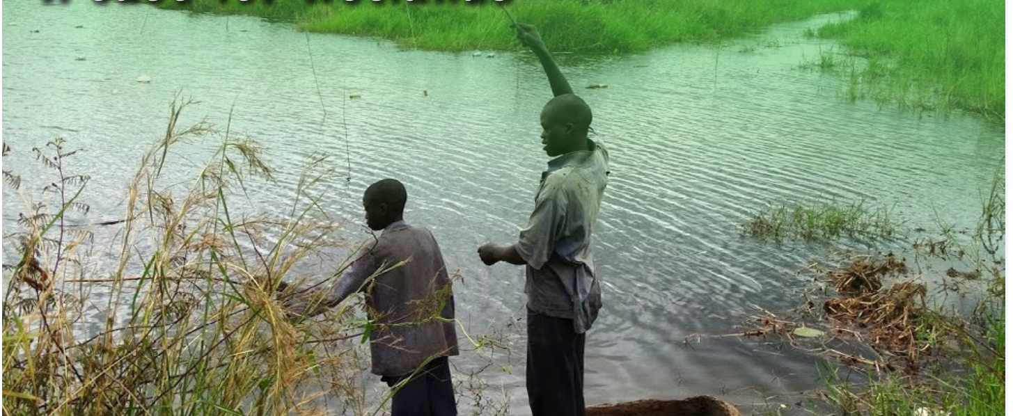
Children fishing in a wetland

A t a glance, wetlands – large expanses of swamps – seem like public nuisances, a waste of space; occupying prime land which could otherwise be turned into sprawling shopping malls, hotels or theme parks devoid of any green.