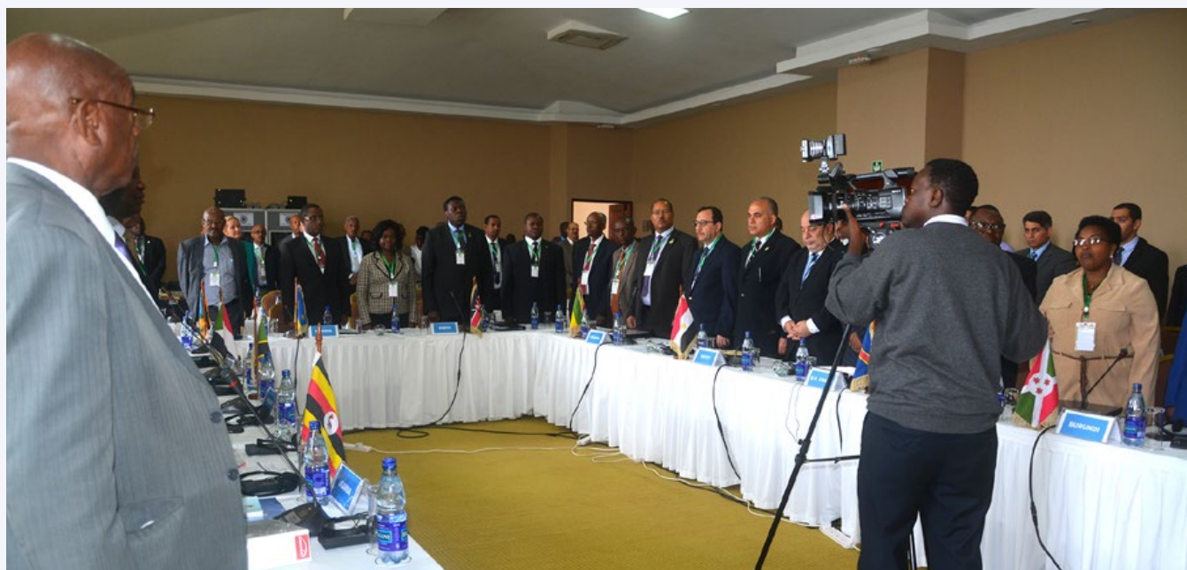
Opening ceremony of the 24 th Annual Nile-COM meeting

The 24 th annual Nile-COM meeting was attended by Ministers in charge of Water Affairs or their representatives from the Nile Basin states, officials from the government of Uganda, Nile-TAC members, development partners, representatives of civil society, and management staff of NBI, among others.