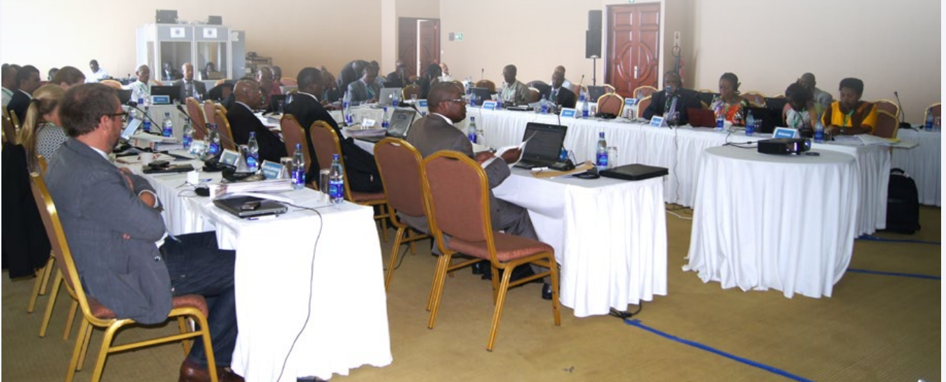
Nile-TAC members during the meeting

T he 46 th Nile Technical Advisory Committee (Nile-TAC) meeting was held on 13 th July, 2016 at Protea Hotel in Entebbe, Uganda. The purpose of the meeting was to prepare for the 24 th annual Nile Council of Ministers (Nile-COM) meeting which took place on the 14 th July, 2016 at the same venue.