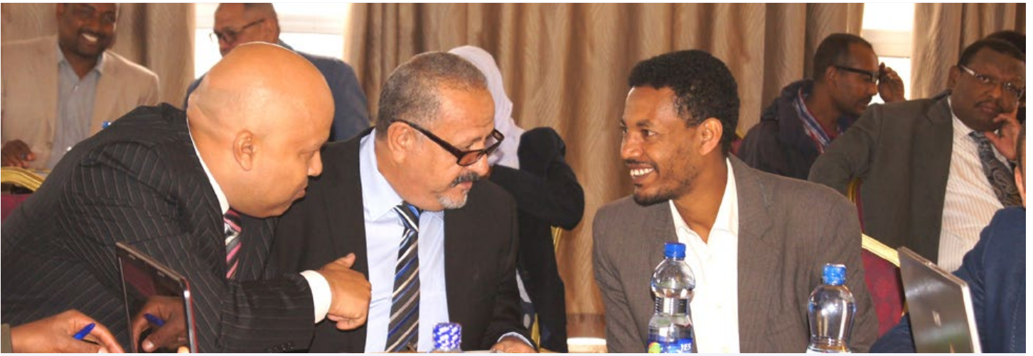
L-R: Journalists from Egypt, The Sudan and Ethiopia in a discussion during the training.

how the dialogue on the GERD has been sustained despite tough negotiations.