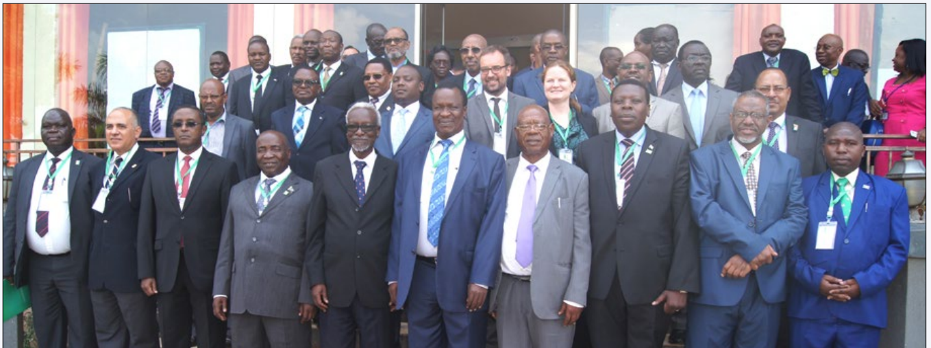
Ministers and other dignitaries take a group photo with the guest of honor, the Rt. Hon. Kirunda Kivejinja (fifth from the left).

The 24 th annual meeting of the Nile Council of Ministers (Nile-COM) held on 14 th July, 2016 in Entebbe, Uganda, addressed strategic issues to advance Nile Cooperation as well as offered policy direction with regard to the sustainable management and development of the shared Nile Basin water resources.