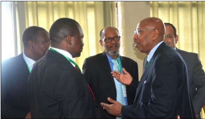
Nile-TAC members in a discussion during coffee break