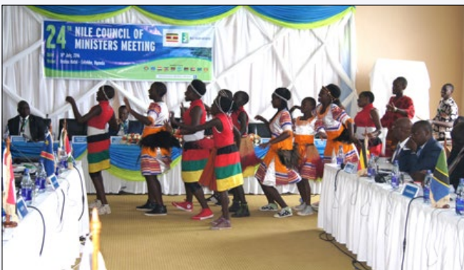
School children entertain delegates during the official opening ceremony