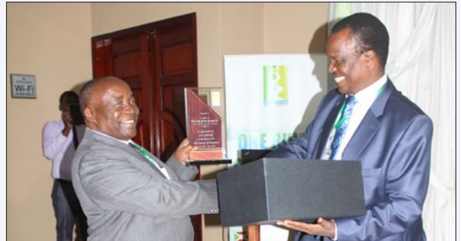
Hon. Sam Cheptoris (right), hands over an appreciation plaque to his predecessor, Hon. Eng. Gerson Lwenge