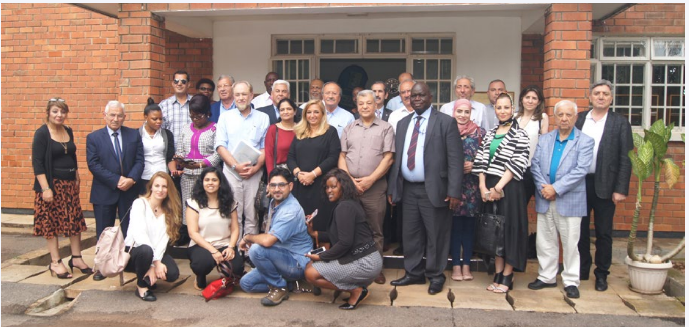
Members of the delegation and NBI staff take a group photo in front of the Secretariat offices