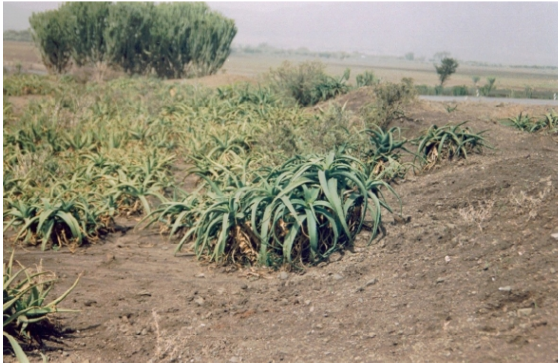
Annex 6-Photo 6.3 Sisal as Live Fence in Kondaltiti Wereda