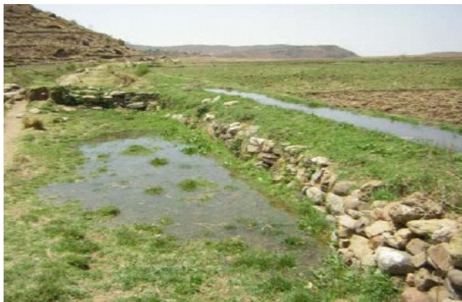
Annex 5-Photo 5.1 Conveyance Loss in Haiba CMI, Tekeze Basin