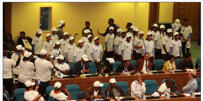
Children sing during the Nile Day celebrations at the UNECA Conference Centre in Addis Ababa