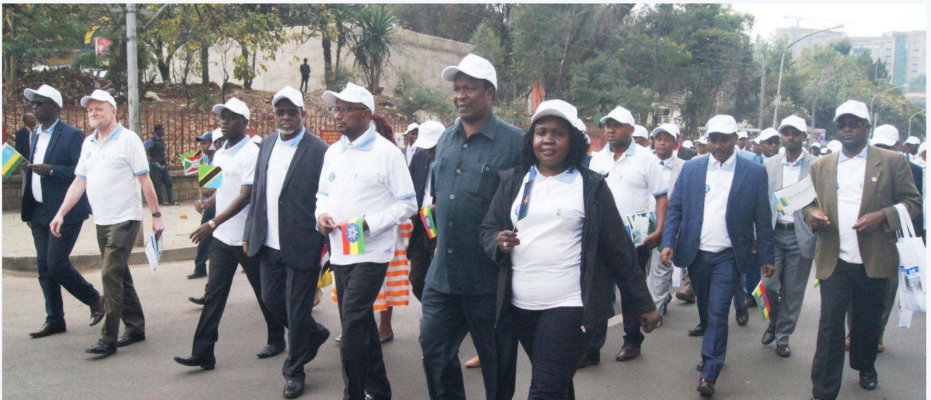
Ministers in charge of Water Affairs in the Nile Basin countries, together with Special German Envoy on Nile Affairs, march from Meskel Square to the UNECA Conference Centre in Addis Ababa, to mark Regional Nile Day 2018 event

T hree females, each brandishing a mace, which they alternately threw up into the air and swung around, led the brass band as it snaked its way along a 1.8-kilometre stretch from the Meskel Square to the UN Conference Centre in Addis Ababa, Ethiopia. Following closely behind the band, were school children, Ministers of Water Affairs from the Nile Basin countries, NBI staff, development partners, civil society, media and members of the public, all marching to beautiful sounds from the band.