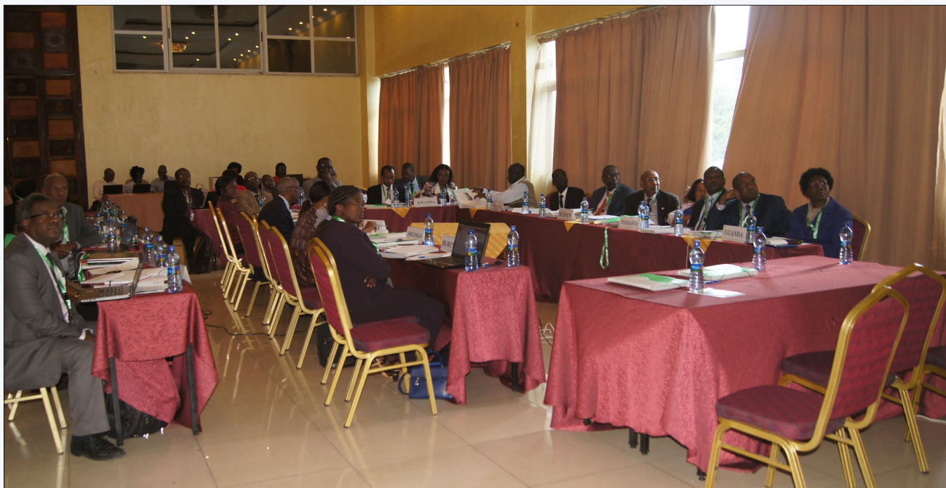
Members of Nile-TAC during the 49 th meeting in Addis Ababa, Ethiopia

T he 49 th Nile Technical Advisory Committee (Nile-TAC) meeting was held on February 21, 2018 in Addis Ababa, Ethiopia. The objective of the meeting was to assess progress in implementation of the institutional as well as the NBI Basin Wide Programme and provide guidance on how to move forward.