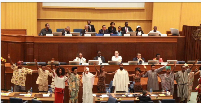
An Ethiopian Cultural Group entertains participants during the Nile Day celebrations at the UNECA Conference Centre in Addis Ababa