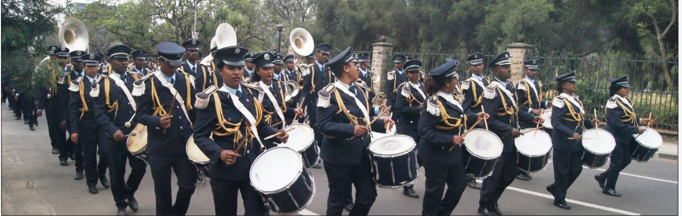
A brass band leads the procession from Meskel Square to the UNECA Conference Centre in Addis Ababa, to mark Regional Nile Day 2018 event