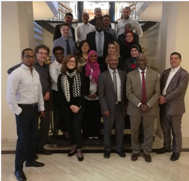
Workshop participants and trainers in Istanbul, Turkey

The NBI Secretariat took part as co-trainer in a workshop on Decision Support Systems and Water Diplomacy organized by UNESCO-IHE Delft – The Netherlands. The objective of the workshop was to enhance capacity on combined use of Decision Support Systems and Water Diplomacy techniques in addressing water conflicts.