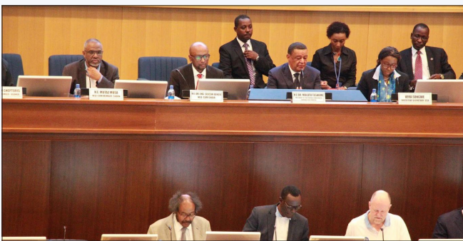
President of the Federal Democratic Republic of Ethiopia, Dr. Mulatu Teshome (back row, 4 th left), addresses participants at the UNECA Conference Centre in Addis Ababa