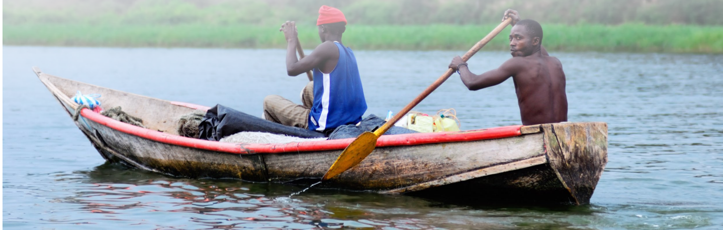
Fishermen on River Nile, a major water resource shared by the Nile Basin countries

The 3 rd National Experts Group workshop on strategic water resources analysis took place February 19 – 20, 2018 in Addis Ababa, Ethiopia. Participants discussed and enriched the main building blocks and finalized the roadmap for the second phase of the analysis.