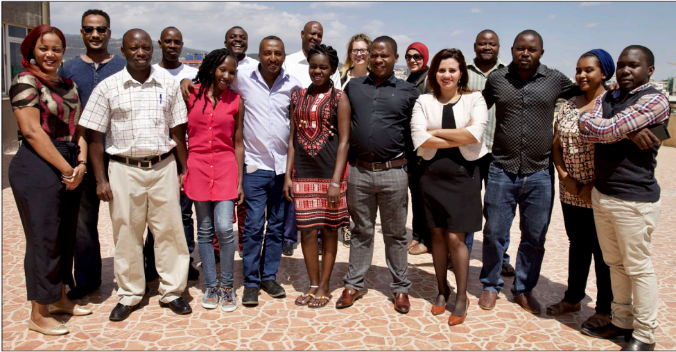
Journalists who attended the 3 rd Regional Nile Media workshop from 20 to 23 February in Addis Ababa, Ethiopia

O n the sidelines of the Regional Nile Day 2018 event held on February 22, in Ethiopia's capital Addis Ababa, the NBI Secretariat convened 18 journalists from across the NBI Member States for a Regional Media workshop, with two missions: To spread the messages and spirit of Nile Day across the Basin; and to continue developing coverage on Nile Basin issues that inform and engage their readers, viewers or listeners – and thereby offer a factual and constructive input to the public debate surrounding the Nile.