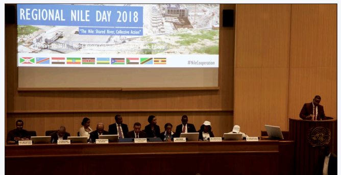
Delegates at the UNECA Conference Centre in Addis Ababa