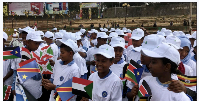
Pupils of Assay Primary School prepare to join the brass band-led procession from Meskel Square to the UNECA Conference Centre in Addis Ababa, to mark Regional Nile Day 2018 event