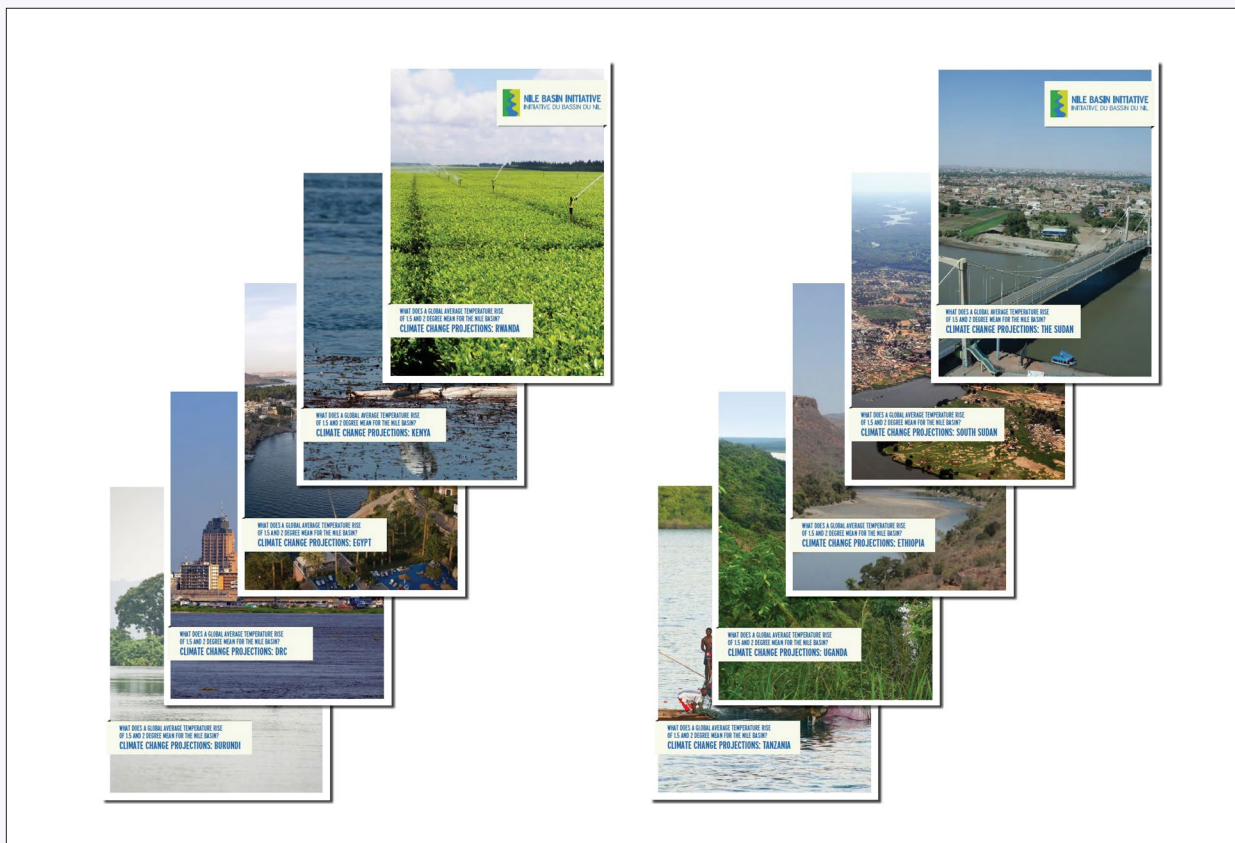
Climate bulletins per NBI Member State

You can access these knowledge products from http://nileis.nilebasin.org/