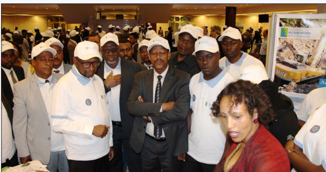
Ministers in charge of Water Affairs in the Nile Basin listen to a presentation about how NBI is managing the river's water resources